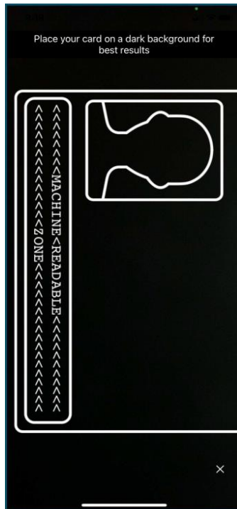
8. Scan your passport picture with your phone camera, OR...